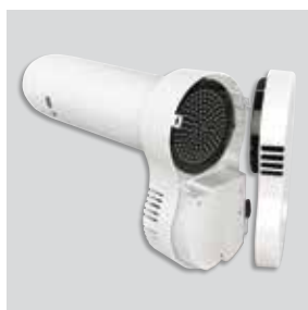
Maintenance and cleaning: Easy access.