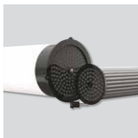
Tubular heat exchanger 100 or 150 mm.